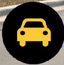
TRAFFIC ENGINEERING STUDIES

Lee Engineering's goal is to provide clients with innovative and practical solutions, while delivering superior technical expertise.