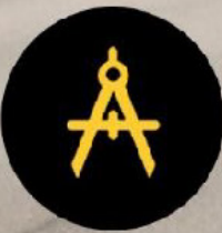
TRAFFIC ENGINEERING DESIGN