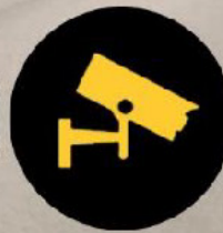
INTELLIGENT TRANSPORTATION SYSTEMS